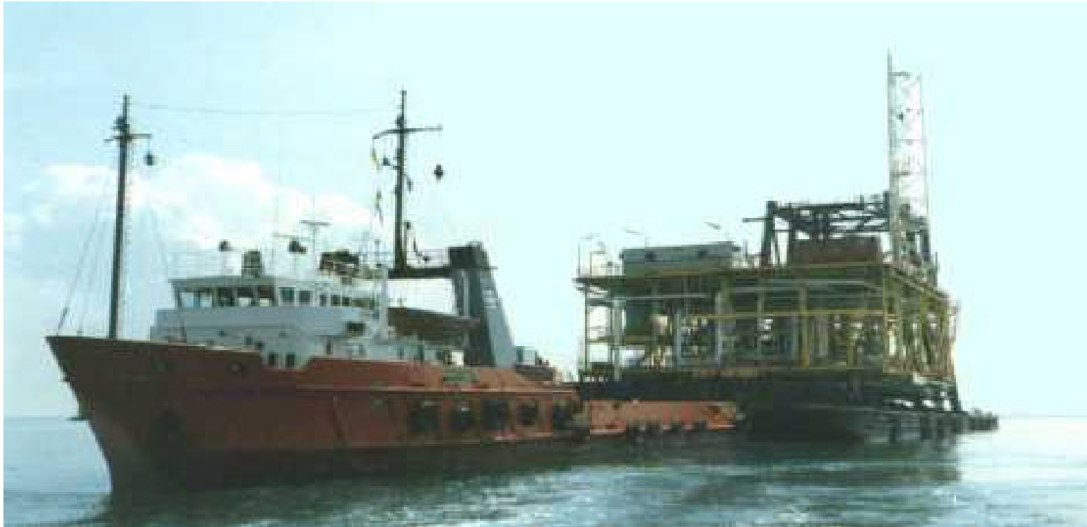
Transporting off-shore platform (AMCA-9) Singapore to Brunei