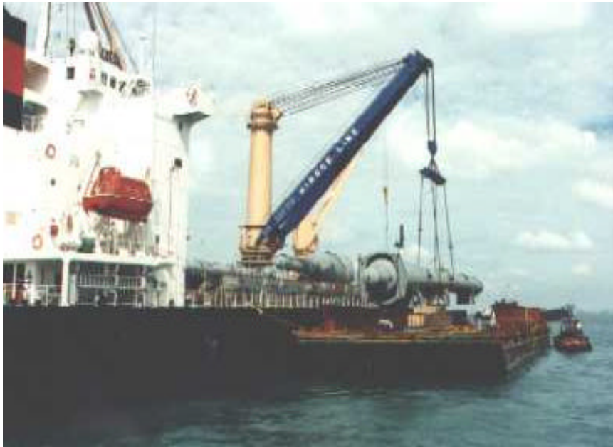
Anchorage operation. Discharging 200ton Pressure Vessel Barging to Malacca