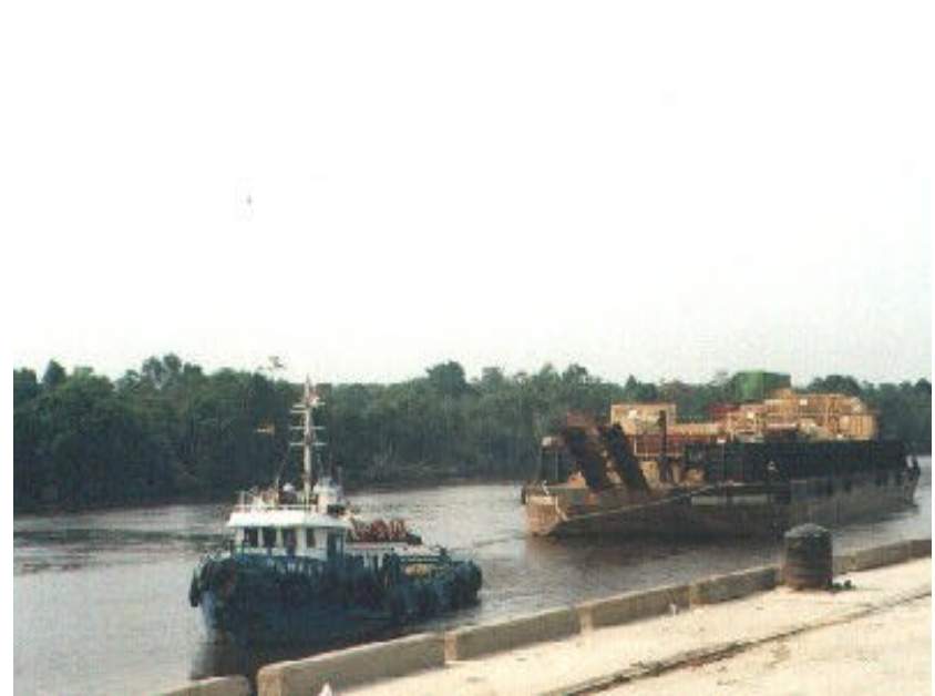
Tran-shipment ex Singapore. Barging to outlying river jetty.