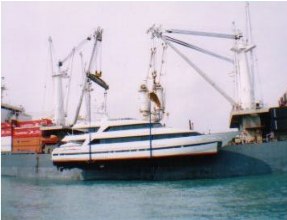
Handling of pleasure craft