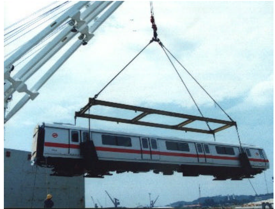
Handling of MRT wagon at PPW